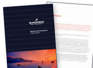
Investment Analysis Reports