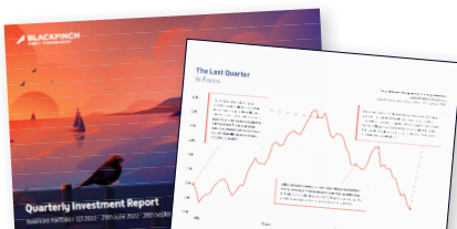
Quarterly Investment Reports