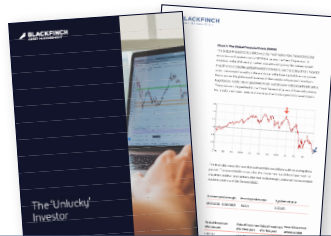
Ad-hoc Market Commentaries

Included in your communications pack, you will receive: