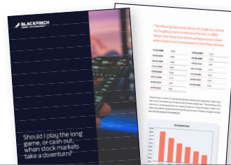
Thought Leadership Pieces