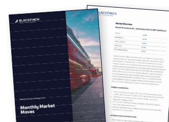
Monthly Market Moves